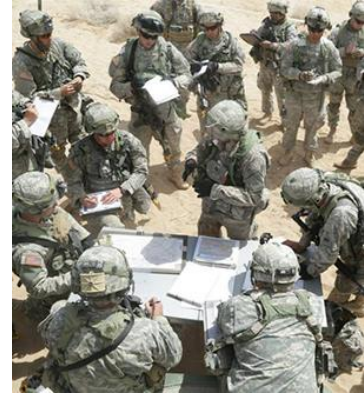
Above: 3 rd Brigade Combat Team, 1st Cavalry Division from Fort Hood, TX during a training exercise at the National Training Center.