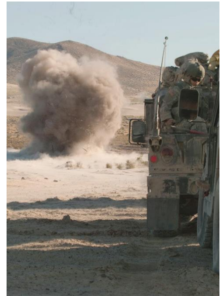
Above: Soldiers with the 609th Engineer Company conduct training at range B-19. These explosive charges were some of the largest the NVARNG had ever used in training.