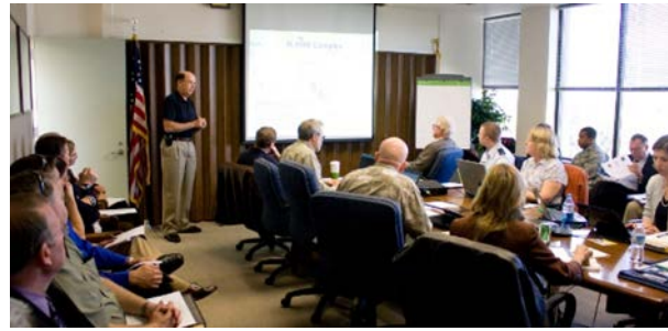
Photo from aviation meeting co-sponsored by WRP and the State Aviation Journal.

A GIS Support Group works with the WRP Steering Committee to assist all Committees.