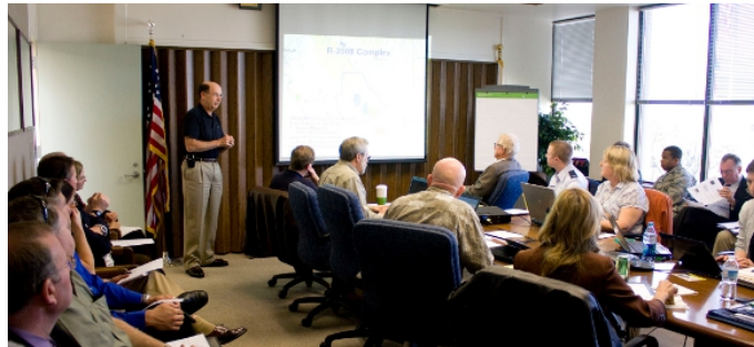
Photo from aviation meeting co-sponsored by WRP and the State Aviation Journal.

A GIS Support Group works with the WRP Steering Committee to assist all Committees.