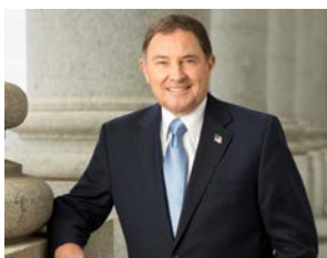
The Honorable Gary Herbert , Co-Chair of WRP, Governor of Utah

"The Western Regional Partnership is a great forum for states, the federal government and sovereign tribes to come together as equal partners in helping to resolve issues that impact military readiness and other key issues in the west."