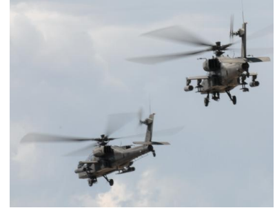
Above: AZ ARNG AH-64D Longbow helicopters conduct live fire training at Gila Bend Range.