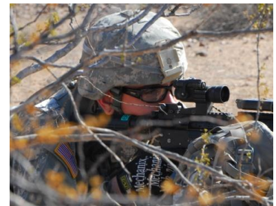
Above: 1-158th Infantry Soldiers conducts small arms weapon training.