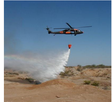
Above: AZ ARNG UH-60 Blackhawk conducts water bucket training in preparation for Arizona's wildfire season.