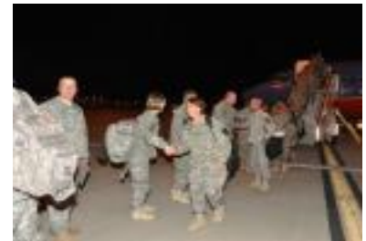
Above: AZ ARNG Soldiers returning from deployment in Afghanistan.