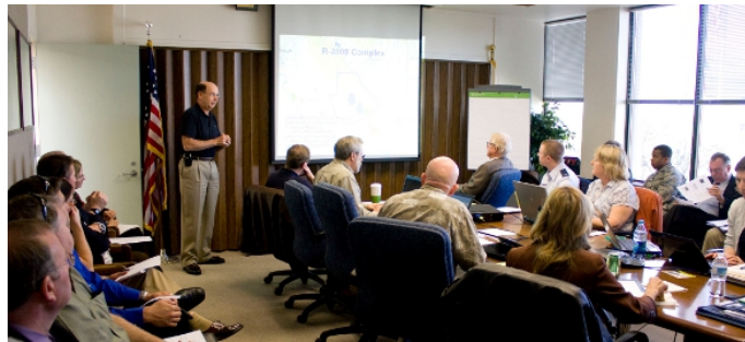
Photo from aviation meeting co-sponsored by WRP and the State Aviation Journal.

A GIS Support Group works with the WRP Steering Committee to assist all Committees.