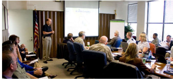
Photo from aviation meeting co-sponsored by WRP and the State Aviation Journal.

A GIS Support Group works with the WRP Steering Committee to assist all Committees.