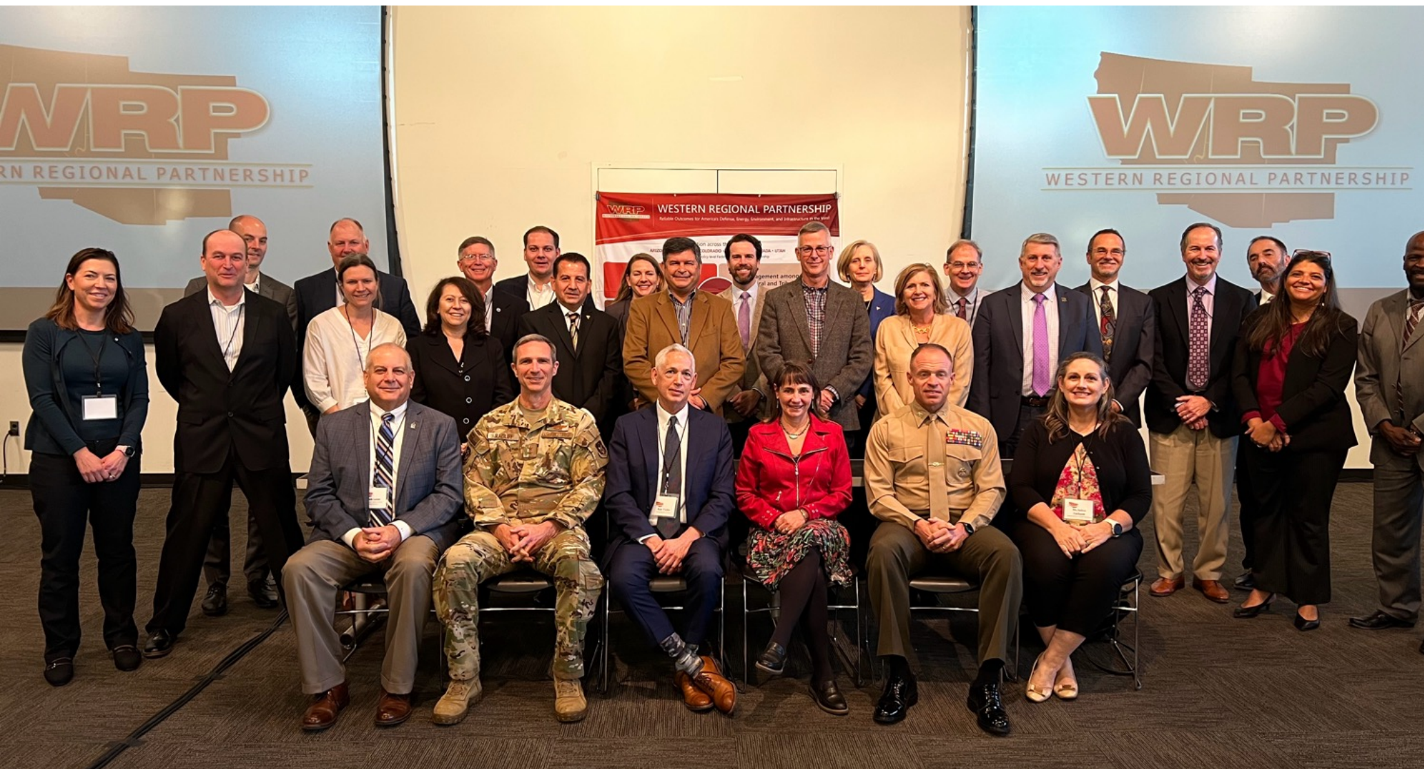
2022 WRP Principals' Meeting December 8-9 ❖ Phoenix, AZ 137 senior policy-level leaders and supporting staff in attendance