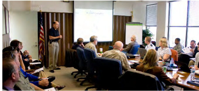
Photo from aviation meeting co-sponsored by WRP and the State Aviation Journal.

A GIS Support Group works with the WRP Steering Committee to assist all Committees.