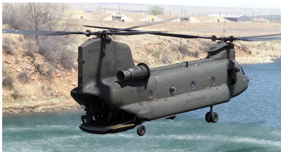
Ranch lands near Fort Carson protect training by shielding noise from the CH-47 heavy-lift helicopter.

For all REPI Project Profiles visit: www.repi.mil/BufferProjects/ProjectList.aspx